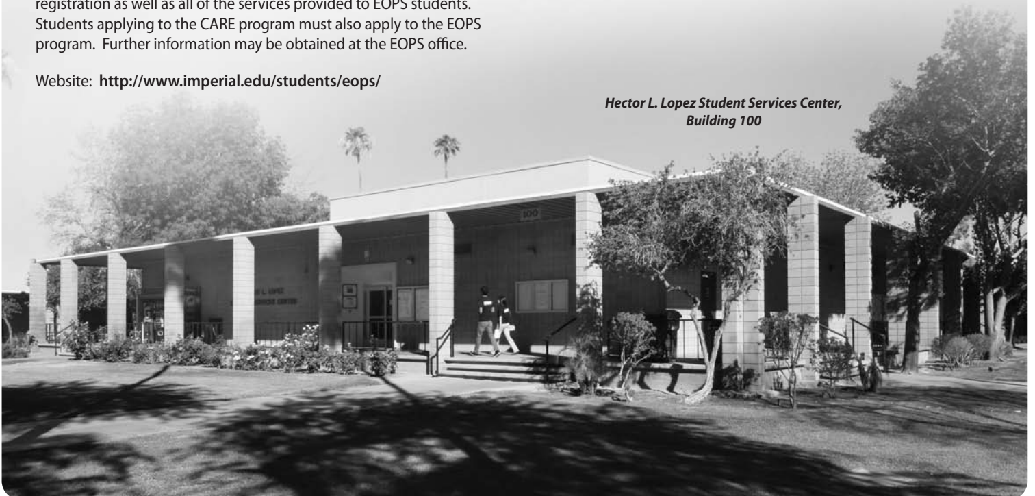
Hector L. Lopez Student Services Center, Building 100

Student Support Services is a federally funded program designed for students who possess the potential and motivation to succeed in college. The primary goal of the program is to provide support and to ensure students the opportunity for the best possible education. Services include, but are not limited to, academic, career and personal counseling; cultural and educational field trips; and workshops.