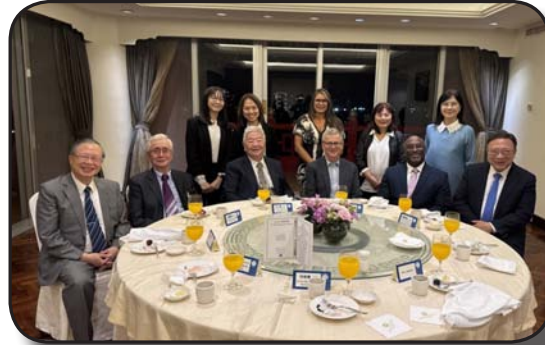
Accreditation Site Visit for the Accreditation Council for Chinese Business Education - Taiwan